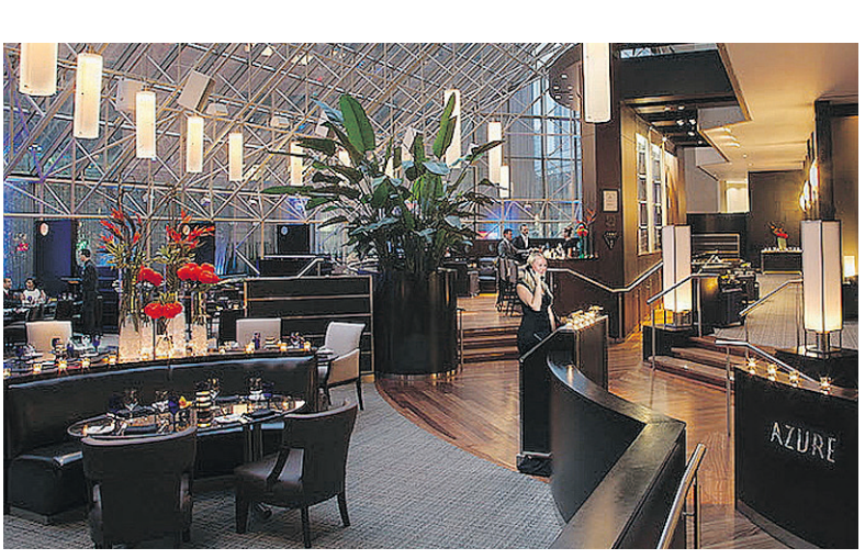
Azure Restaurant & Bar is bathed in sunlight or the glow of nightlights.

And heck, why not have it all? The 25-storey InterContinental Toronto Centre features 584 well-appointed guest rooms and suites known for their