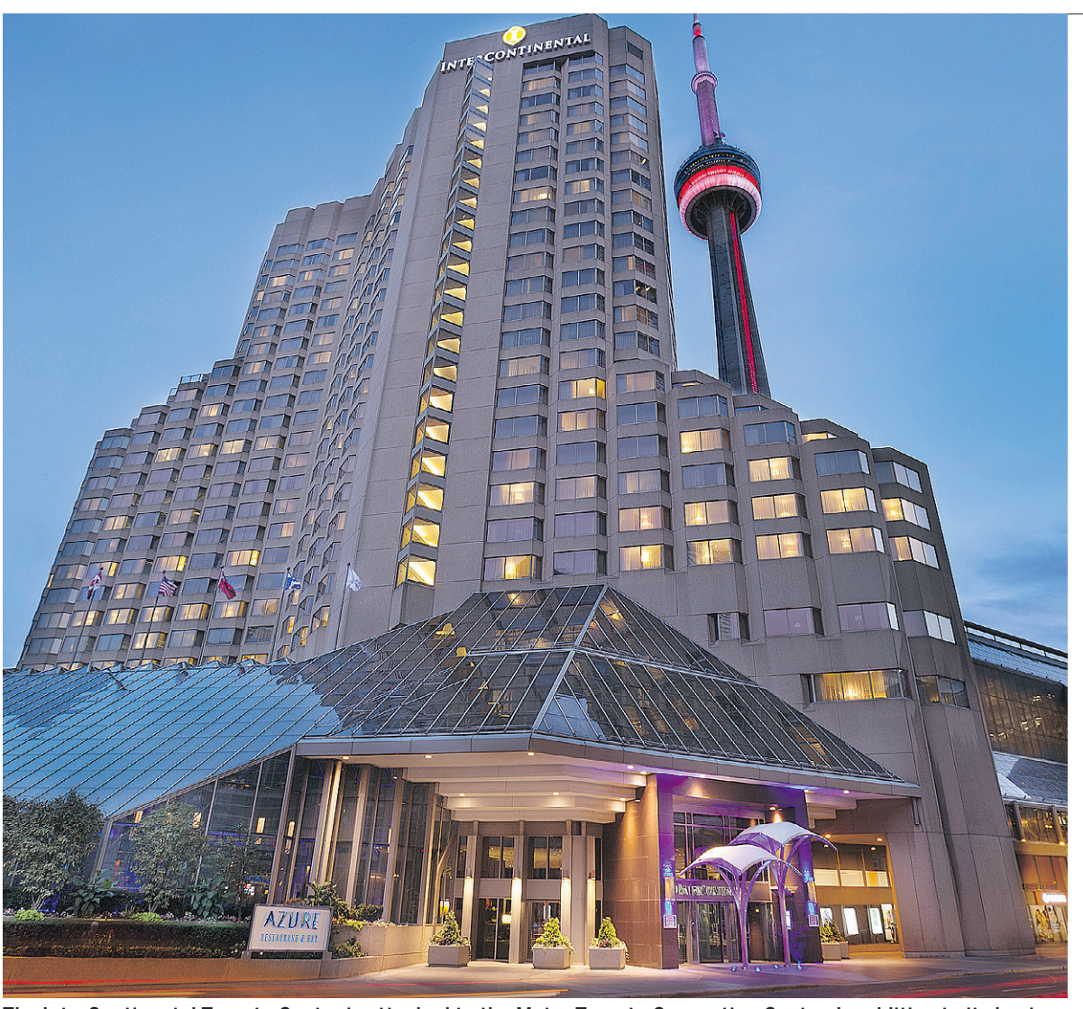
The InterContinental Toronto Centre is attached to the Metro Toronto Convention Centre. In addition to its business connections, the hotel is popular with families.